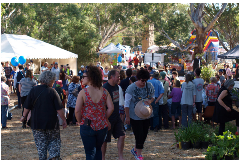
Busy! The crowd - mid-morning