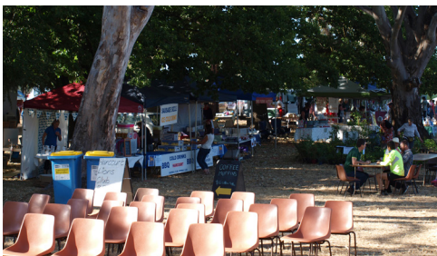
Early morning - before the crowd