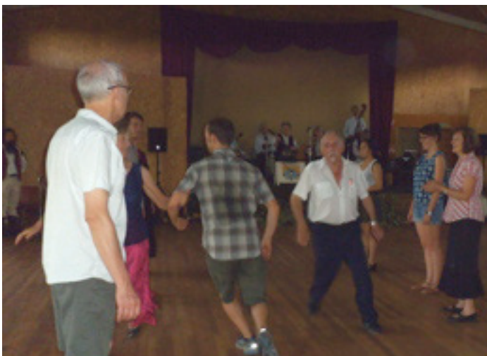
Photo below shows Fund Raising Bush Dance for Refugees held at Harcourt Leisure Centre in early February.