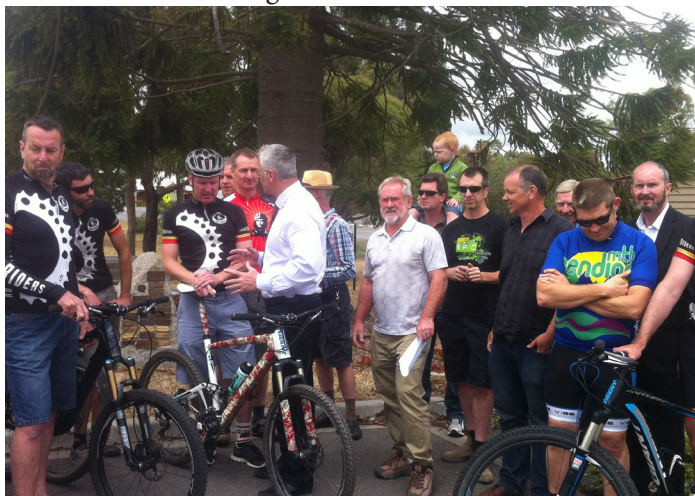
Photo above shows Victorian MP Damian Drum (side-on centre in white shirt) discussing the announcement of the funding proposal with members of the Rocky Riders Club and members of Goldfields Tourism Inc, observed by Harcourt community members

NEWSFLASH: Harcourt Pool will remain open until Monday, 10th March 2014