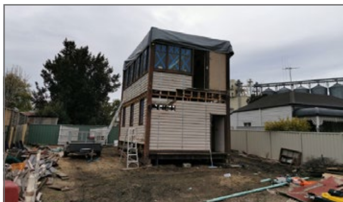
The signal box was prepared for removal in late 2020.