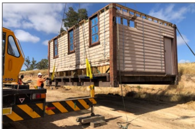
Part of the signal box is lifted off the truck at VMR.