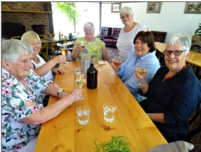
Here's to a better 2021