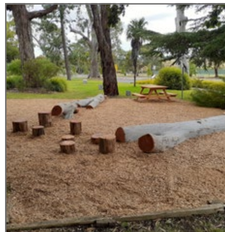
The new play area with climbing logs and picnic table.