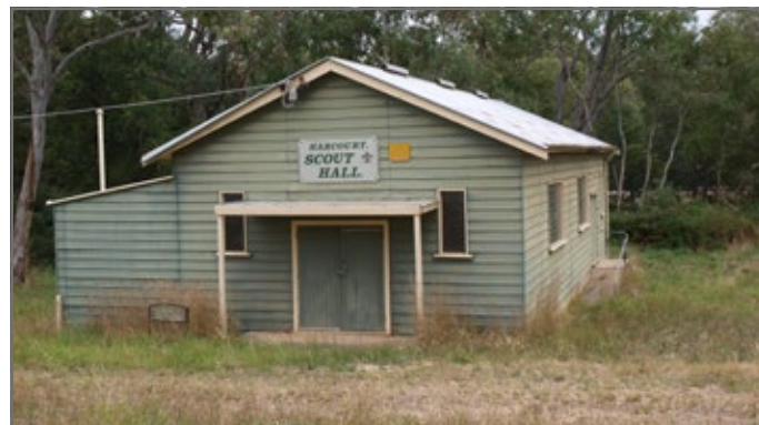
The Scout Hall in Eagles Road, just north of the swimming pool and the new bridge under construction.