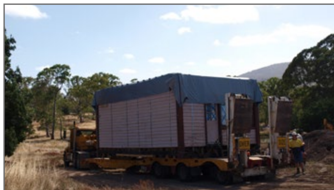
A section of the signal box waits to be lifted off by crane.

over the car park. The Lions will use it as their base and store their equipment on the ground floor, and use the top level as their club rooms. With its height and the location it will feature great views from its upper floor. This is another important milestone for VMR at Harcourt.’