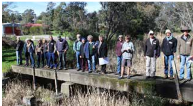
Landcare members and the bridge - before and after.