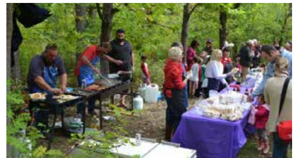
Easter Egg Hunt, Lions barbecue