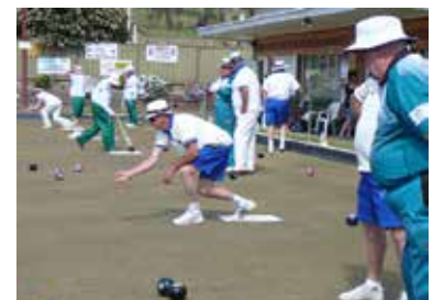
Lawn bowls Saturday pennant