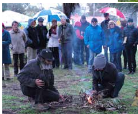
Smoking ceremony at the opening of Harmony Way in July