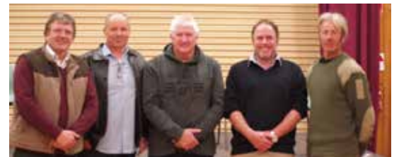
Councillor candidate forum