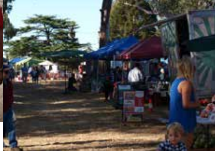
Early morning Applefest